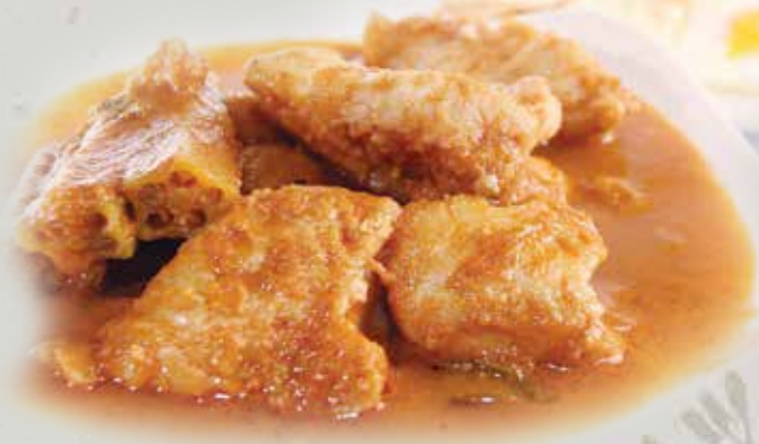
Our Mother's "Fish Curry"