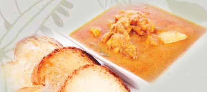
Chicken Curry with "Roti Bengali"