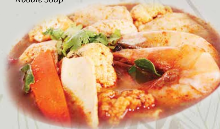
Tom Yam Noodle Soup