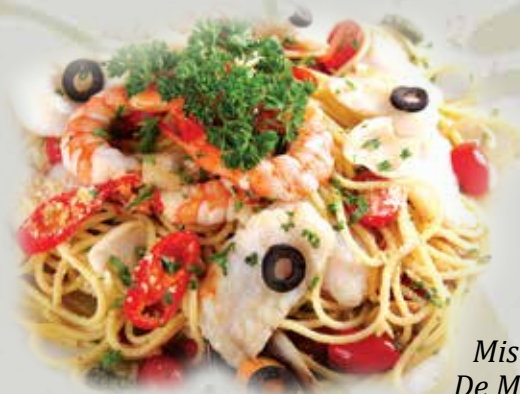
Misto De Mare