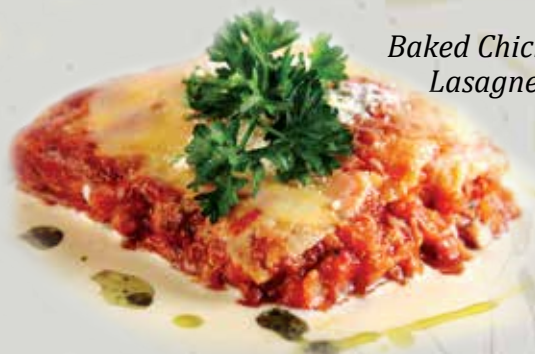
Baked Chicken Lasagne