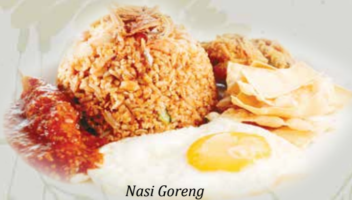
Nasi Goreng Istimewa

Extra charge for any side order of sauces, vegetables or starch